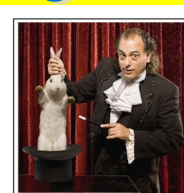
Members' Favorite Effect Night