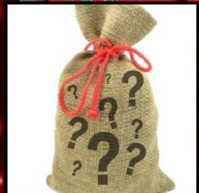
Magical Gift Grab Bag!

North Senior Center 3333 Saint Cloud Drive Seal Beach CA