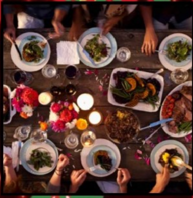
Pot Luck Dessert!