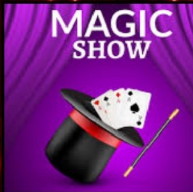
All-Ages Magic Show!