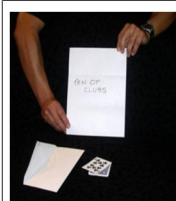
Weird Magic & Mentalism